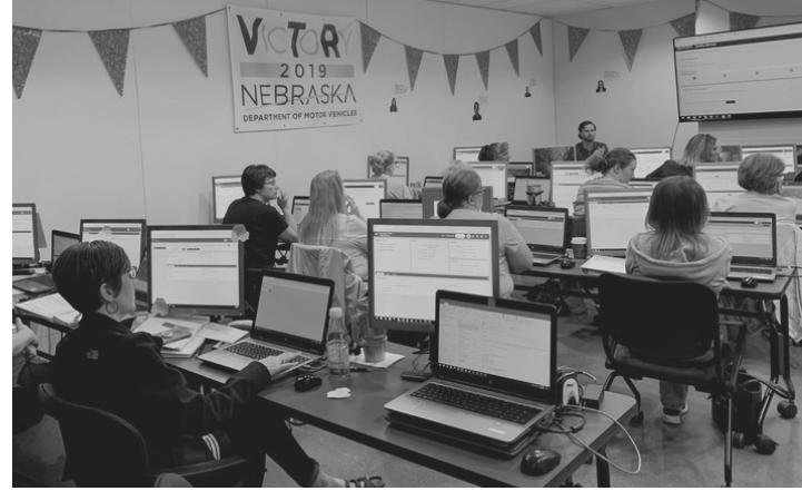
Our fourth group of VicToRy testers hard at work.