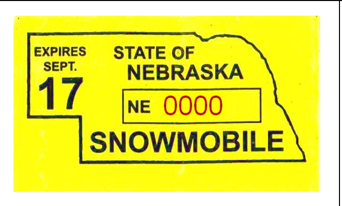
2017 Snowmobile Decal