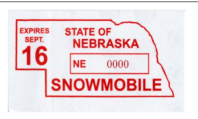
2016 Snowmobile Decal